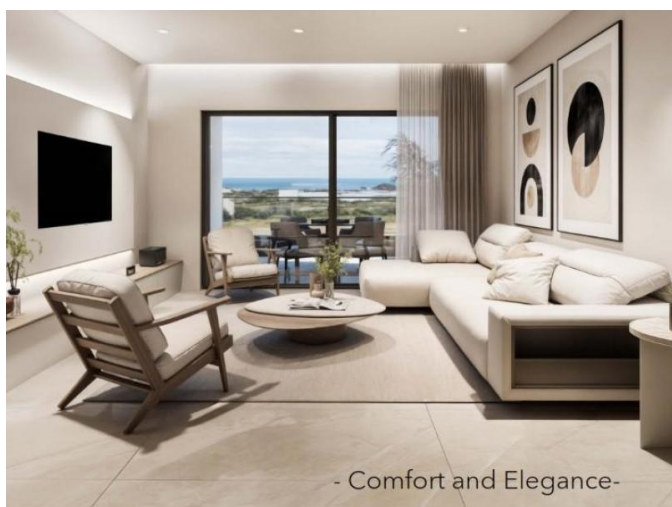
- Comfort and Elegance-