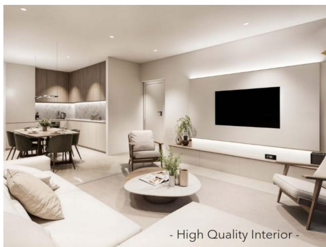
- High Quality Interior -