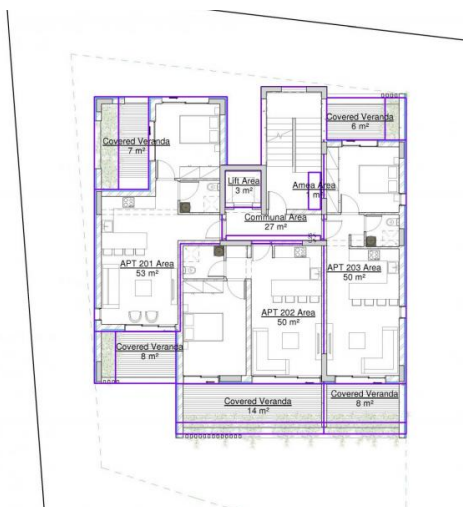
SECOND FLOOR AREAS: -APTS 201: 53sq.m -Cov. Veranda: 53sq.m -APTS 202: 50sq.m -Cov. Veranda: 14sq.m -APTS 202: 50sq.m -Cov. Veranda: 14sq.m -Communal Area: 27sq.m