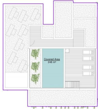
Covered Area 248sq.m

APARTMENT (1BRM) x 6 UNITS APARTMENT (2BRMS) x 2 UNITS TOTAL APARTMENTS = 8 UNITS